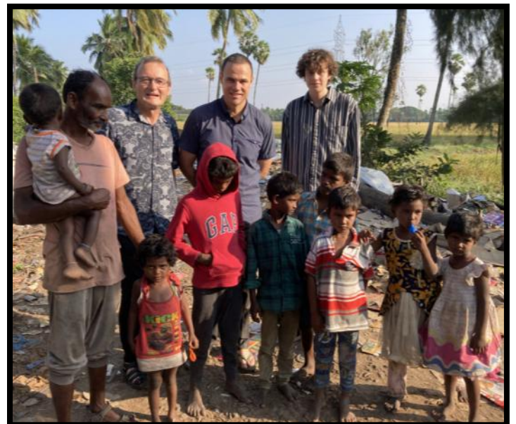
Neglected children in Yenada village dump

Please contact admin@globalnulife.org if you wish to receive newsletter by e-mail. Phone: 07 571 1244